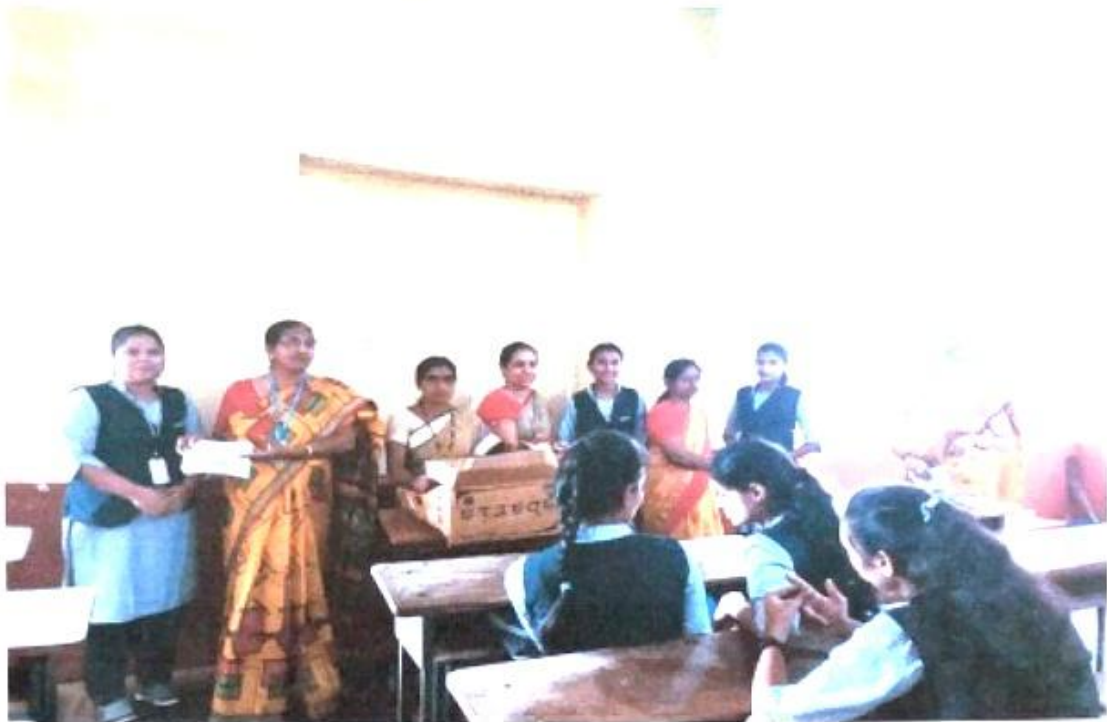
2021-22 Distributed Sanitary pads to college Girls students during the month